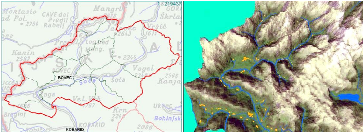
Fig. Topographical map of the location of the test bed

The test-bed is situated in the westernmost part of Slovenia near the Italian border.